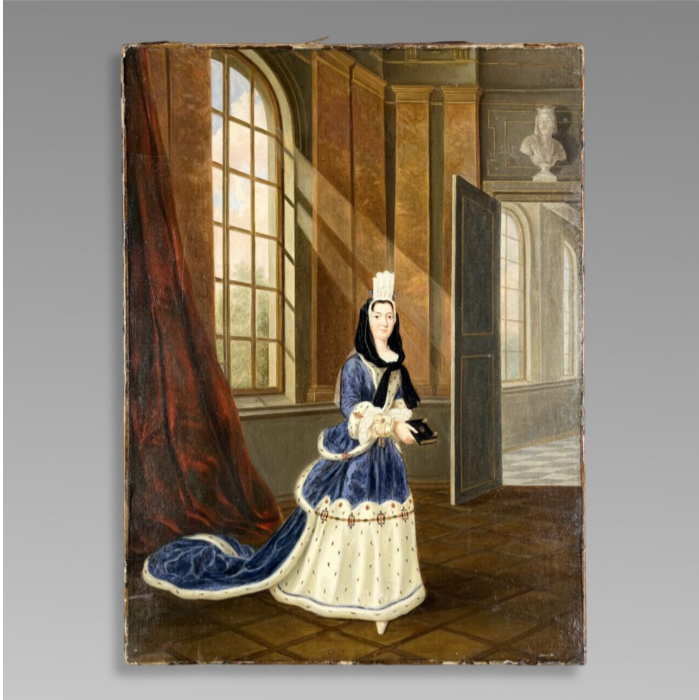
Louis XIV Portrait of Mme. de Maintenon